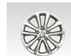
RVI 18" MULTI-SPOKE MACHINE-FACED ALLOY WHEELS WITH POLISHED FACE AND STERLING SILVER FINISHED POCKETS