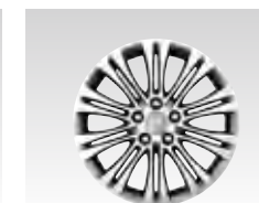
WQN 18" SPLIT-SPOKE ALLOY WHEELS WITH MANOOGIAN SILVER PREMIUM FINISH