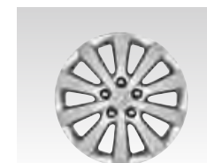
PNM 17" MULTI-SPOKE ALLOY WHEELS WITH STERLING SILVER FINISH